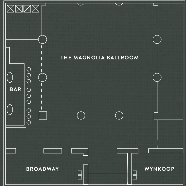
817 17th Street (Across 17th)